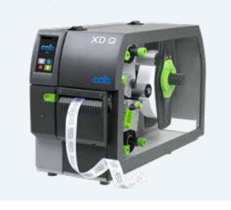
Label printers XD Q double-sided