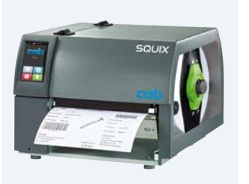
Label printers SQUIX 8.3