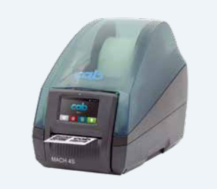
Label printers MACH 4S