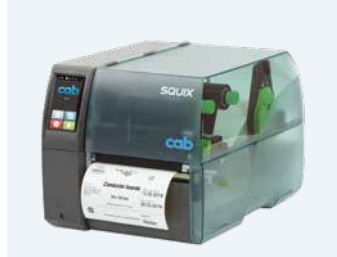
Label printers SQUIX 6.3