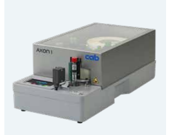
Tube labeling systems AXON 1