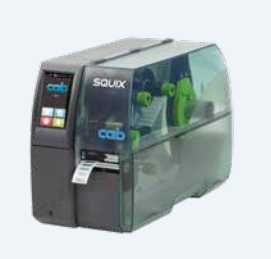
Label printers SQUIX 2