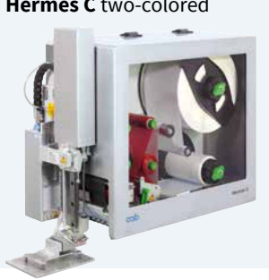
Print and apply systems Hermes C two-colored