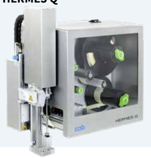
Print and apply systems HERMES Q