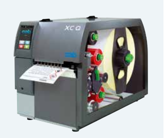
Label printers XC Q two-colored